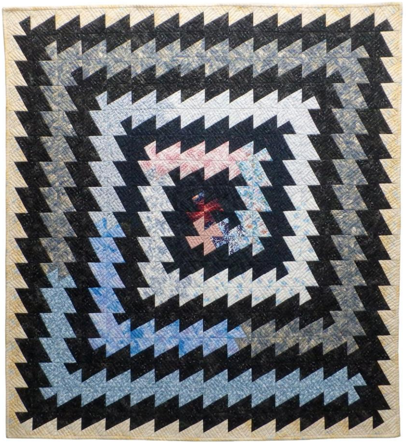
Exhibition and Publication History

--The Art Design Consultants (A|D|C) selected textile artist Jean M. Judd of Cushing, Wisconsin for inclusion in the Blink Art 2020 Showcase Exhibit at their gallery in Cincinnati, Ohio. Artwork selected for inclusion in the exhibit included: Twirling Leaves #3 along with five other artworks: Flaming Grapes, Fractured 'Gello #1, Scribble #2: Black Pathways, and Abstract Textures 2.1 .